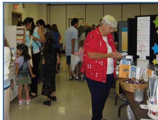
The variety of exhibits provided something of interest for everyone.

Spanish-language brochures, bookmarks, pens and handouts focusing on this year's theme of Healthy Sexual Relationships.